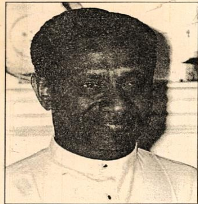
Premadasa is feeling generous

Many Sri Lankans, probably most, blame India for all their troubles. From the early 1980s India supported the Tamil independence movement and allowed Tamil guerrillas to train in the southern Indian state of Tamil Nadu. In 1987 India persuaded the Sri Lankan government to grant the Tamils limited self-rule in the north-east. Indian soldiers were allowed in as a "peace-keeping force" but were soon fighting those Tamils who continued to demand an independent state. An anti-Indian movement